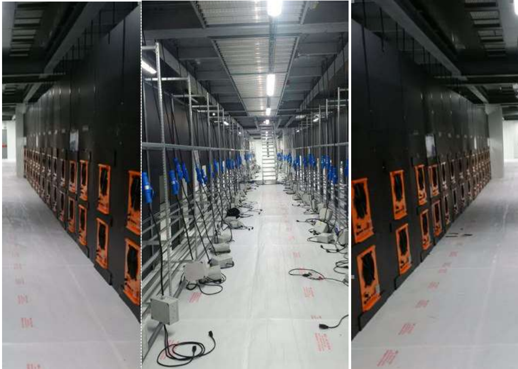
On-site pictures of a temporary containment – Paris / July 2018

Field Note: Rentalload offer toolless shelves and ceilings that align with the proposed rack layouts or contained systems (we will need the design drawing to ensure that the toolless shelves/ceilings are an accurate reflection of the proposed design).