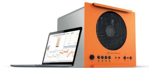
Picture of Rentaload smart rackable load banks (6 kW and 7 kW)

With a precision of 500W, the rack load bank is the most accurate on the market